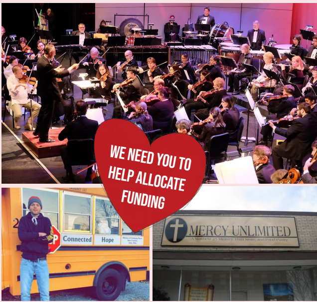
Photos above show recent grant recipients from the Community Connection Fund, including the Lima Symphony Orchestra to fund the Young People's Concert, New Creation for food and supplies for the homeless, and Mercy Unlimited for food store shelving. Grants are allocated quarterly.