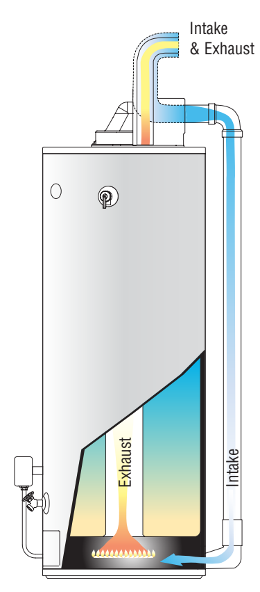
Direct vent gas water heater